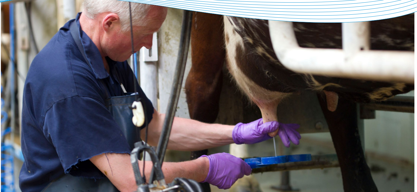
Figure 1. The California Milk Test being used to check for mastitis

From April 2017, a Mastitis Index has been published for all breeds genetically evaluated in the UK. A genomic evaluation is also available for Holstein. This index will allow farmers to breed cows with improved resistance to mastitis, tackling a common issue on farm, on both a genetic and management level. Although there is a strong link between the Somatic Cell Count (SCC) Index and a reduction in mastitis cases, there is a small number of bulls who reduce SCC but not necessarily cases of mastitis – this index will help to identify those bulls and allow farmers to make more informed breeding decisions for their herd.