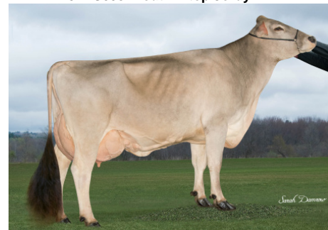
Jordy's Dam: Trout Run Driver Jan P 2nd Lactation