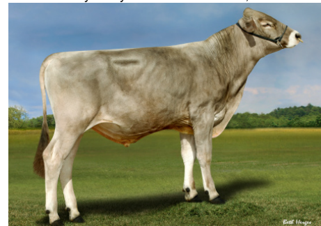
54BS608 Trout Hilltop Jordy ETV