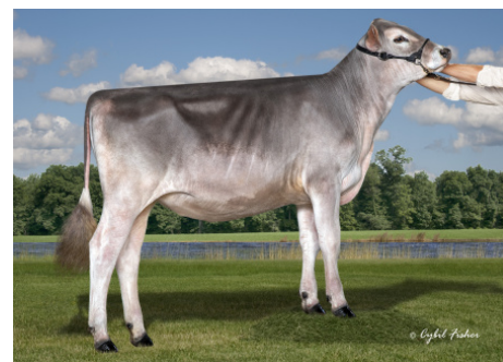
Hilltop Acres Jordy Dane NP 1st place summer yearling Mid-West Regional Brown Swiss Show 2023 Owned by Perry Brook Brown Swiss, Vermont

Sire: Victor-ET P Dam: Trout Run Driver Jan P 'E 90 E 91 MS' 8-07 365d 3x 34,639 4.5 1,574 3.8 1,313 Lifetime: 2,728d 253,280m 12,383f 9,678p MGS: Hilltop Acres H Driver-T TM MGD: Trout Run Jill P 'V85 V86MS' 4-00 307d 2x 19,300 4.8 926 3.3 634