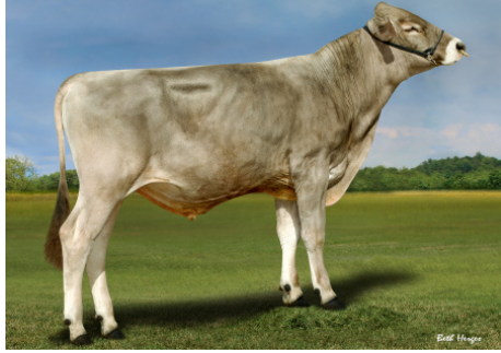
54BS608 Trout Hilltop Jordy ETV