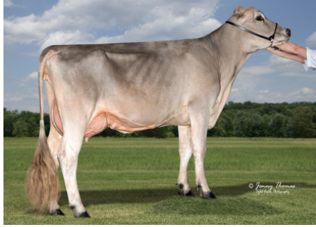
LA RAINBOW SWEET SORAYA ETV 1ST JR TWO YEAR OLD, OHIO STATE FAIR, 2024 OWNED BY: LA RAINBOW FARMS, OHIO