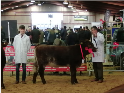
Dtr: Ronaround Sue