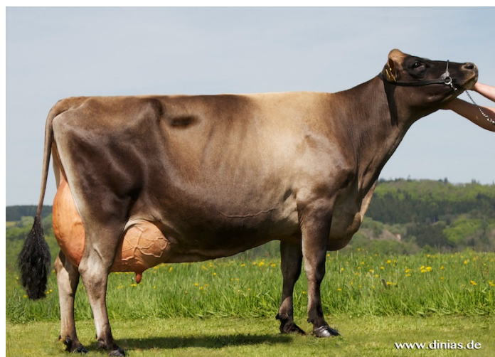
4th dam: Evita EX-91