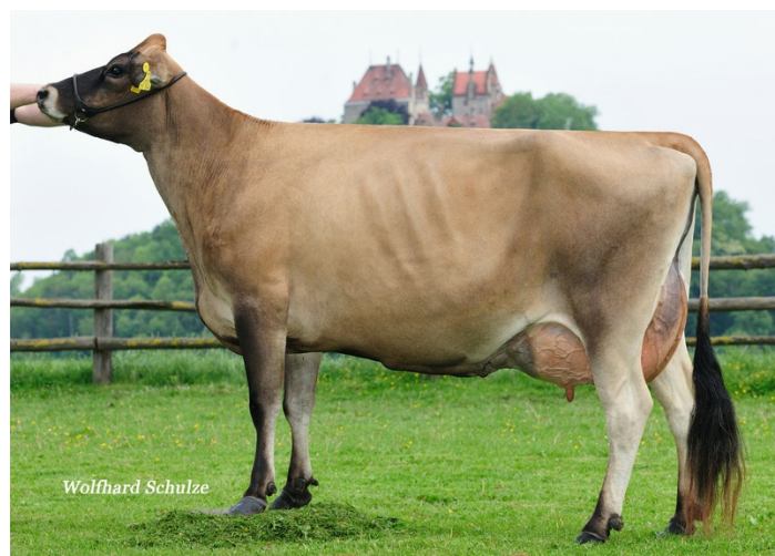
Great Granddam: AS Evett EX-90