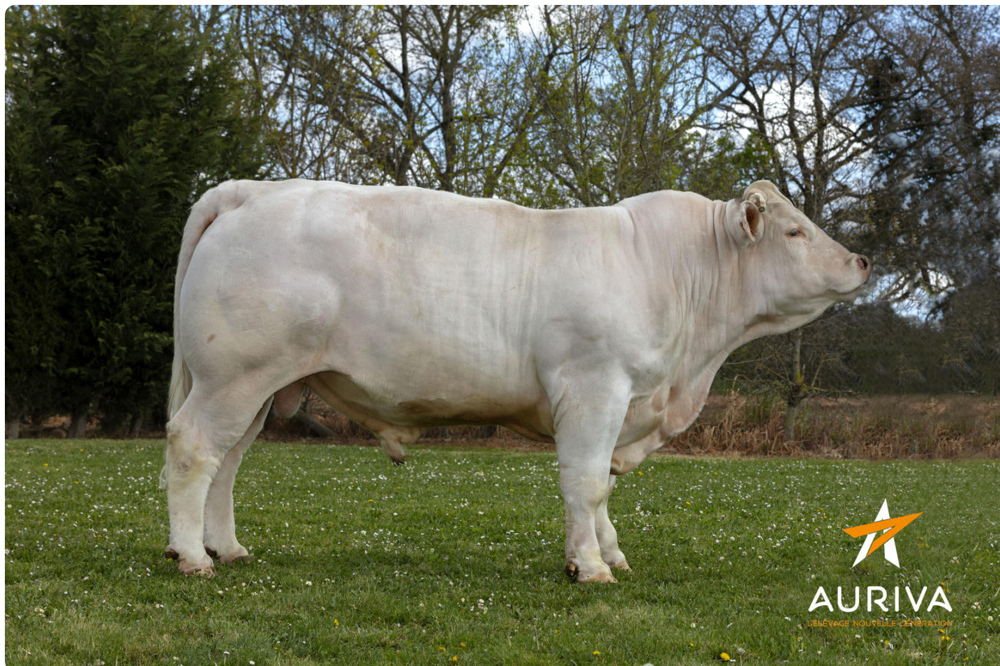
^ MOJITO EXC