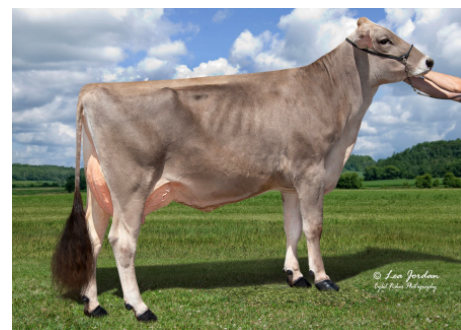
Hilltop Acres DB Whisper ETV 'E 91 E 91 MS' DAM OF 54BS632 WORLD CLASS

Sire: Jennings Gap Time Out Dam: Hilltop Acres DB Whisper-ETV 'E 91 E 91 MS' 2-1 110d 3x 10,380 5.1 526 3.2 330 MGS: Switzer Tals Drdvl Doboy-ET MGD: Top Acres Durham Wintu-ET 'V 87 V 87 MS' 2-8 175d 3x 13,701 3.7 481 3.0 355