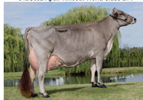
3rd Dam: Top Acres Supreme Wizard ET '2E 95' GRAND CHAMPION WORLD DAIRY EXPO 2017 ALL AMERICAN 2013 & 2017 RESERVE ALL AMERICAN 2012, 2015 & 2016 MEMBER OF ALL AMERICAN PRODUCE OF DAM 2013, '14, '15 AND '16