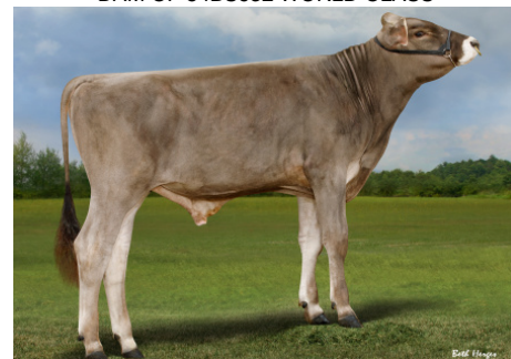
54BS632 Apex Timeout World Class ETV