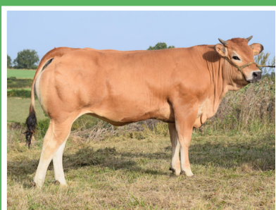
T ES JOLIE