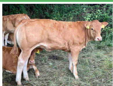
DAUGHTER - GREENSONS URSULA